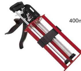
400ml Extrusion Tool

Once the damaged, decayed and discoloured wood has been removed by use of a suitable cutter tool such as a router or chisel, then the area to be treated is lightly sanded to ensure excellent adhesion. The moisture content of the wood should be no greater than 18% (check using a standard moisture meter) and damp wood should be allowed to dry naturally, or by way of a hot air gun. The two components are mixed manually into a separate container, and thoroughly agitated for one minute. The 2:1 mixing ratio should be strictly observed. EWS should be applied directly onto bare wood in the repair area using a standard brush and then left to cure for 30 minutes, prior to carrying out the repair. Please refer directly to the Timbabuild® EWS data sheet for more details.