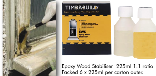
Epoxy Wood Stabiliser 225ml 1:1 ratio Packed 6 x 225ml per carton outer.

EWS primer system is a specially designed two-part low viscosity, solvent free, resin solution which is designed to strengthen weakened wood fibres by penetrating deep into the wood. The product is used as a primer in conjunction with the Timbabuild Wood Repair systems.